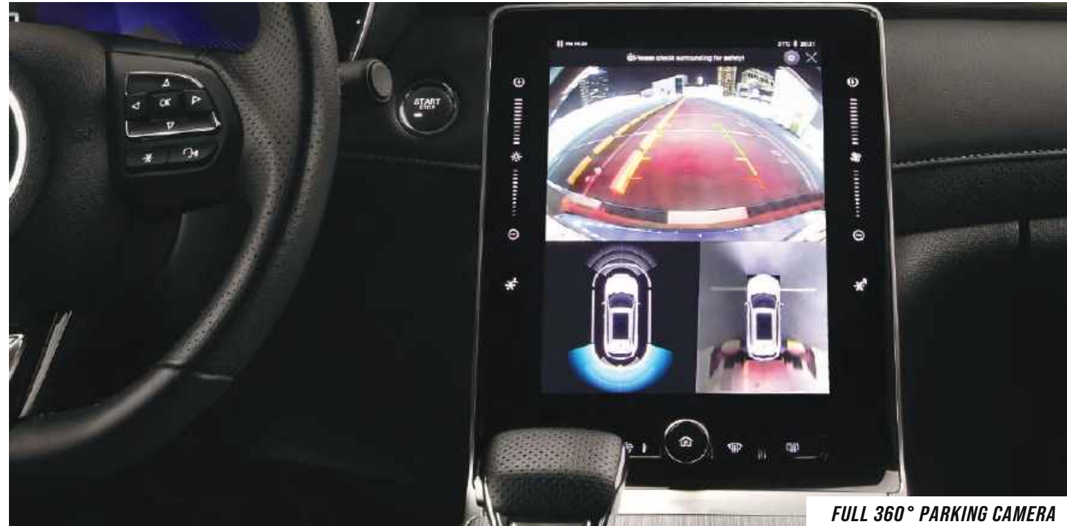
FULL 360° PARKING CAMERA

Everyday life in the MG RX5 is more than easy thanks to a host of handy features. Seamlessly load and store anything you please with fold-flat seats and enjoy extra passenger storage space which makes any road trip or city cruise that little bit more convenient.