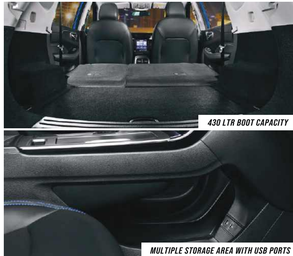
430 LTB BOOT CAPACITY

From the moment you set foot inside the RX5's newly enhanced cabin, it immediately becomes a difficult place to leave. With an entirely new dashboard design, navigate through a plethora of features from a 14.1" tablet-inspired touchscreen display, as well as a 12.3" fully digital navigation cluster for the driver.