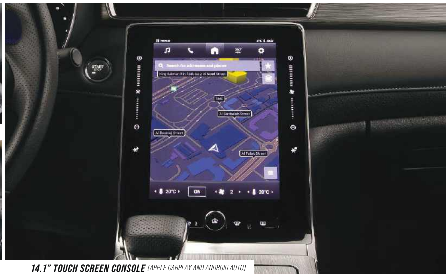
14.1" TOUCH SCREEN CONSOLE (APPLE CARPLAY AND ANDROID AUTO)

From the moment you set foot inside the RX5's newly enhanced cabin, it immediately becomes a difficult place to leave. With an entirely new dashboard design, navigate through a plethora of features from a 14.1" tablet-inspired touchscreen display, as well as a 12.3" fully digital navigation cluster for the driver.