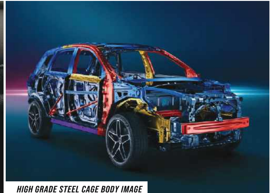
HIGH GRADE STEEL CAGE BODY IMAGE