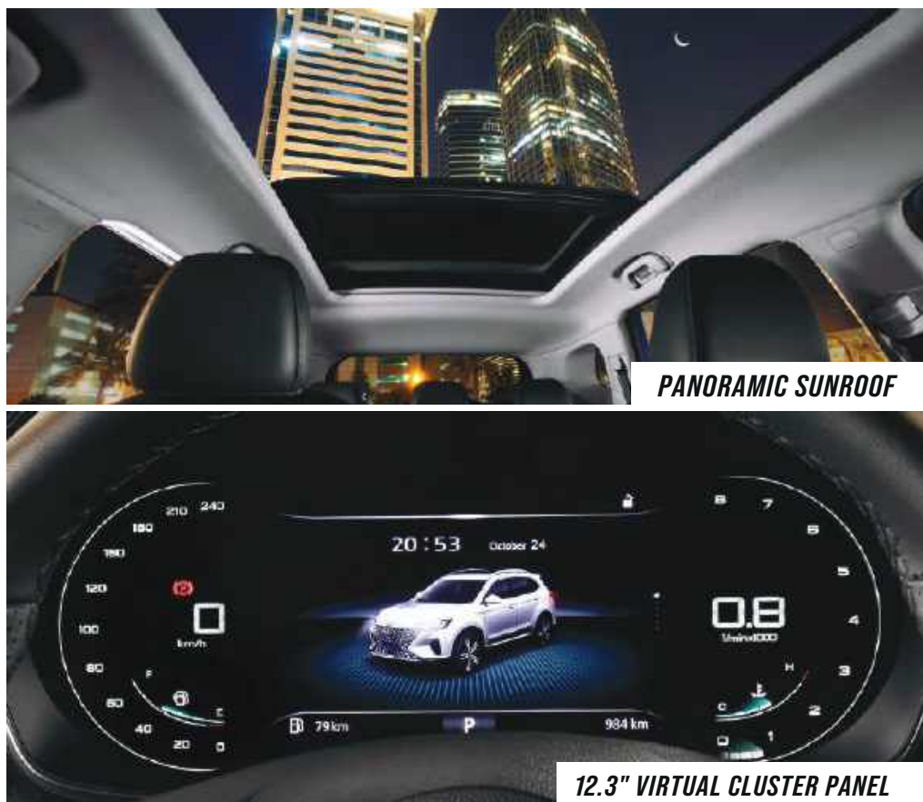
12.3" VIRTUAL CLUSTER PANEL