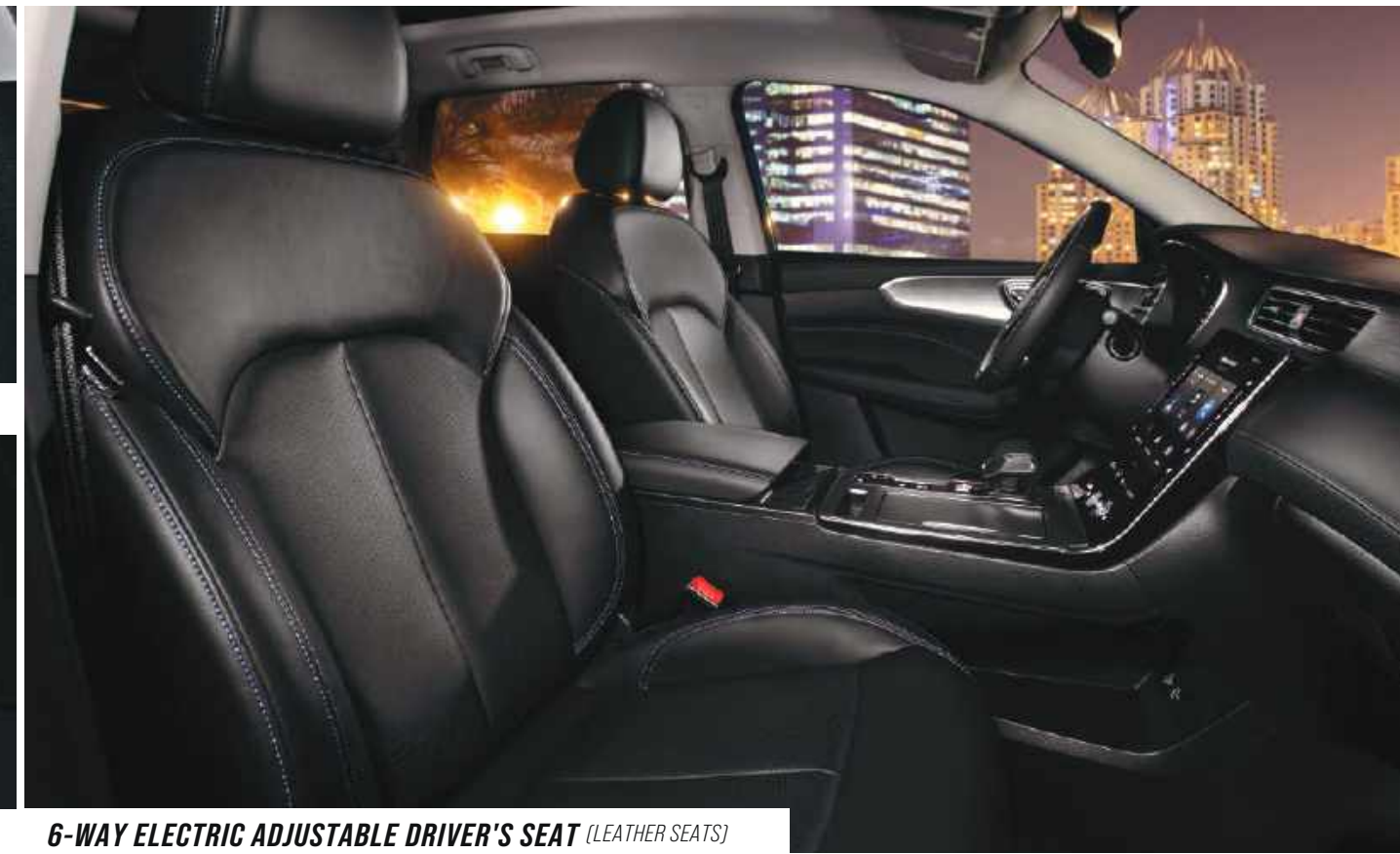
6-WAY ELECTRIC ADJUSTABLE DRIVER'S SEAT (LEATHER SEATS)

Everyday life in the MG RX5 is more than easy thanks to a host of handy features. Seamlessly load and store anything you please with fold-flat seats and enjoy extra passenger storage space which makes any road trip or city cruise that little bit more convenient.